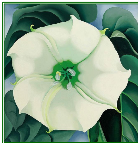
Jimson Weed / White Flower No. 1 , 1932 oil on canvas by Georgia O'Keeffe

Wishing you all a happy and healthy New Year!