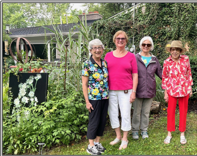
Above: Morning shift at 2023 garden walk, Garden Stories – garden # 1