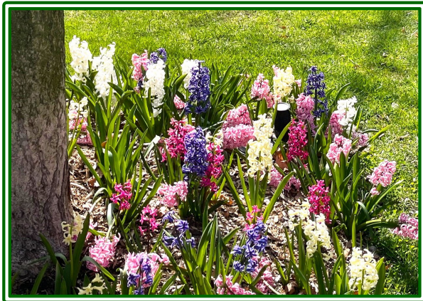
Hyacinths in southeast Oakland County in mid-April, 2024

"In the spring, at the end of the day, you should smell like garden soil."