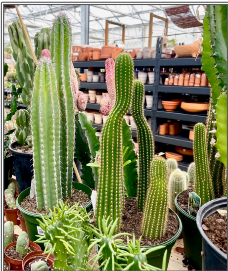
Clockwise, beginning above with (1) George, (2) irresistible orchids, (3) a very large cordyline, (4) rows upon rows of tiny but optimistic fuchsias in large hanging pots, (5) undulating cacti, and (6) the soaring greenhouse