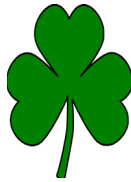
~ internet image

TGC members have signed up as indicated below. Please arrive by 11:45 am with your food already prepared, and be sure to provide a serving utensil for your food item.